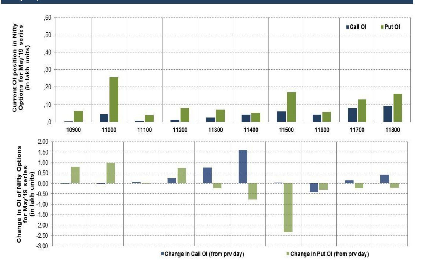
Note – Change in OI of Nifty Options refers to change from previous trading day Source-NSE, SIHL Derivatives Research (Institutional Equities)